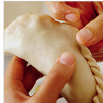
A Future for Home Cooks, Made by Hand