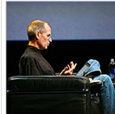
Robert Wright: Is Steve Jobs Big Brother?