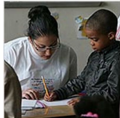
New Small Schools Face Extra Pain From Layoffs