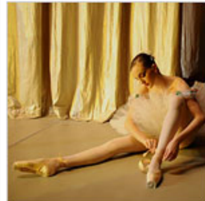
Ask the Dancers: Young Americans at the Bolshoi