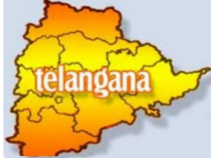
Stir to continue till Telangana state is formed: KCR

Keywords: India , Politics News , Andhra Pradesh , Telangana state , KCR , Posted On: 25-Apr-2010 10:55:42 By: R Venkat